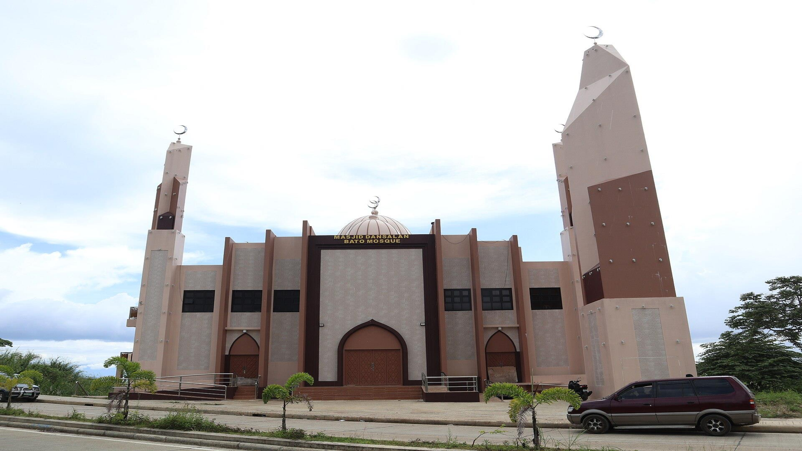
MASJID DANSALAN BATO MOSQUE